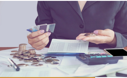
Table 3 can help you compare your total out-of-pocket expenses for one year of school. You will want to think through the financial impact of your entire educational journey — and what opportunities you may have each year to change this equation (summer job, scholarships, etc.).