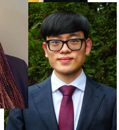
2021-2022 Grand Prize Scholarship Winners