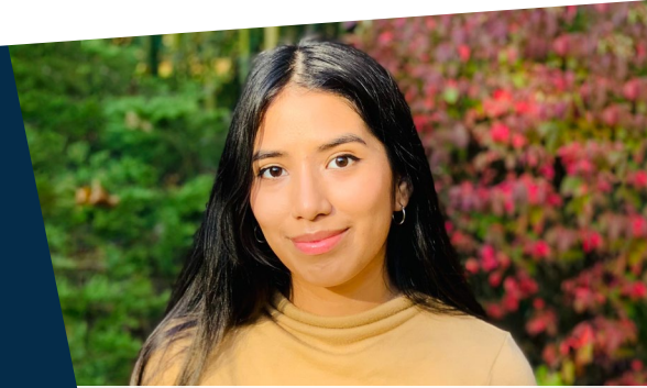
A 2021-2022 $5,000 Winner

AccessLex Institute, a nonprofit dedicated to legal education, has partnered with your school to bring you MAX by AccessLex ® , the free personal finance program designed exclusively for law students!